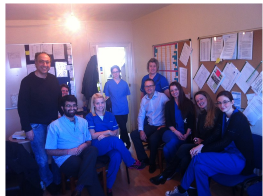
Photographed—FiCTION team from Sheil Road Dental Practice, Liverpool